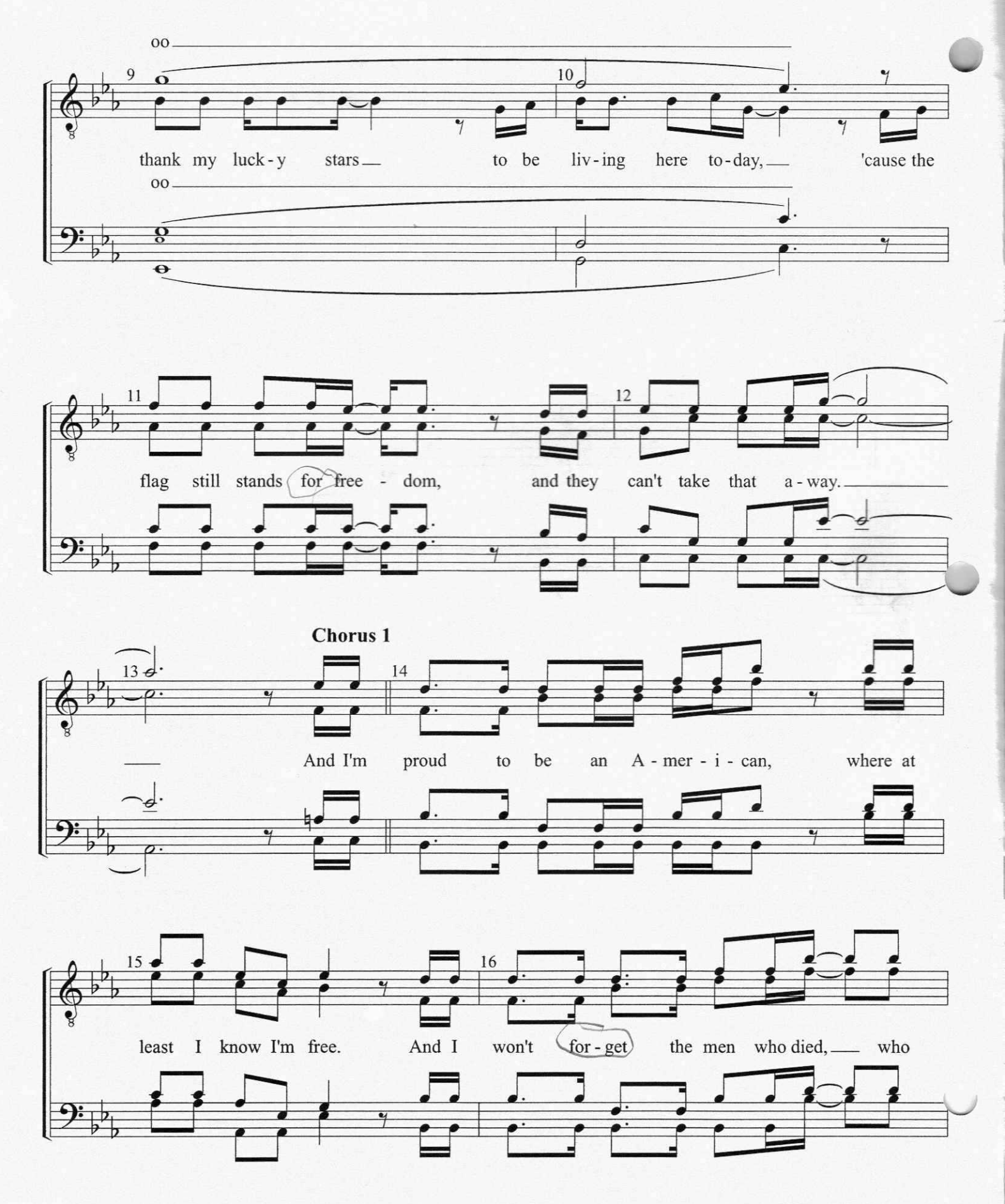
God Bless the U.S.A.